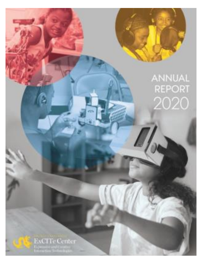
1 - Annual Report 20207

(For past reports follow this link: <a href="https://bit.ly/exciteannualreport">https://bit.ly/exciteannualreport</a>)