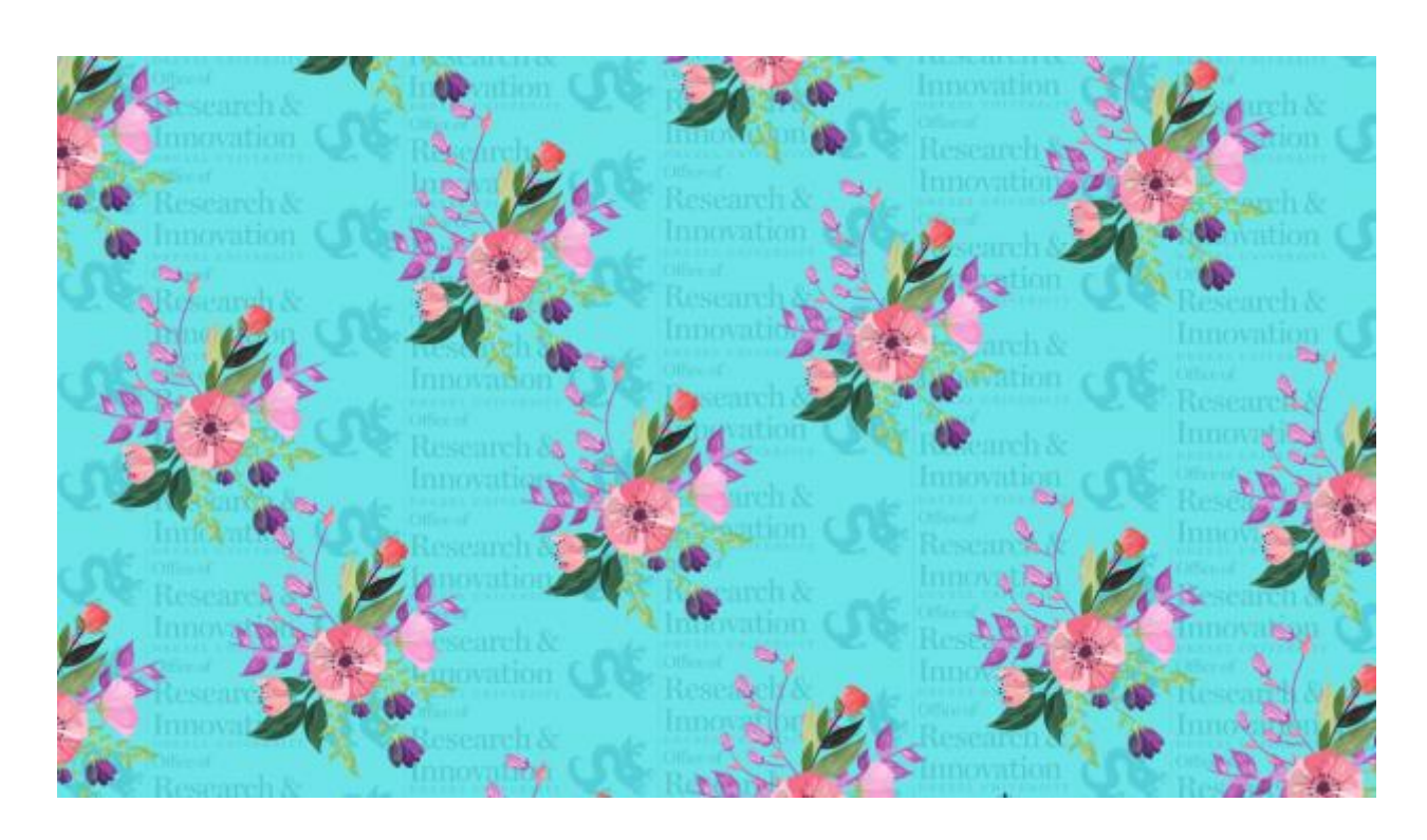
Office of Research & Innovation Newsletter · March 2021