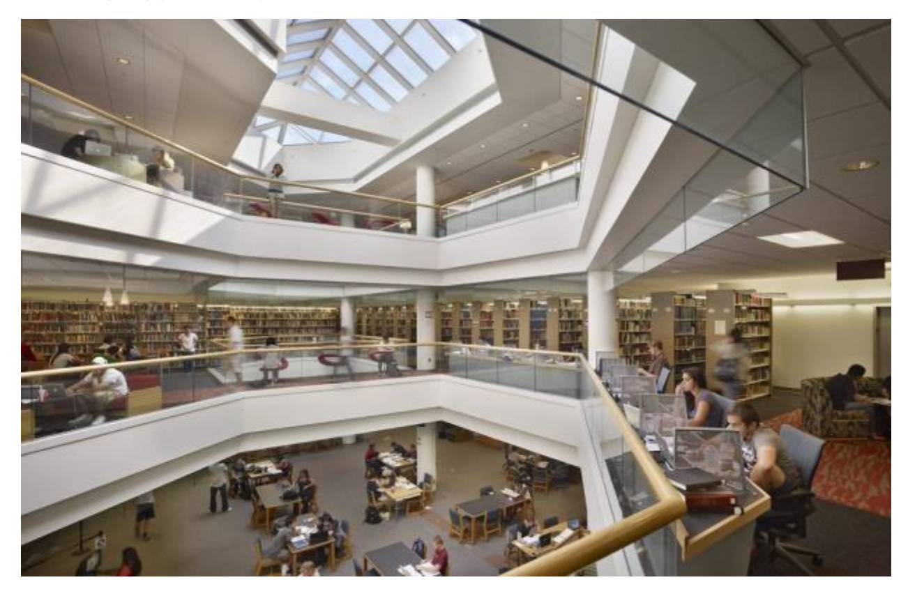
Now Available in Research.gov: Three New Proposal Types and Proposal Withdrawal Functionality

Effective March 22, the National Science Foundation (NSF) enabled three new proposal types in the Research.gov Proposal Submission System and in the recently launched Research.gov Proposal Preparation Demo Site. These are the Facilitation Awards for Scientists and Engineers with Disabilities (FASED), Equipment, and Travel proposal types. New automated compliance checks and associated error and warning messages for these proposal types were also implemented. In addition, proposal withdrawal functionality was added for both single submission (with or without subawards) and separately submitted collaborative proposals from multiple organizations. New training resources have also been added to the Research.gov About Proposal Preparation and Submission 8 page.